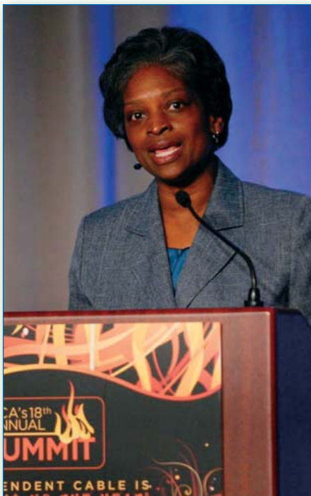
Below: Attendees at the Opening Session of ACA's 18th Annual Washington Summit conference.